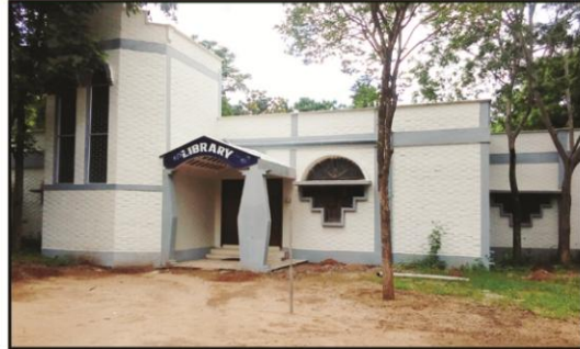
Renovated library building: Exterior view.