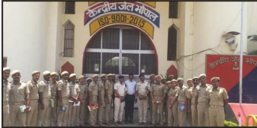
Trainee officers of 23 rd Batch of Basic Course during their visit to Central Prison, Bhopal.