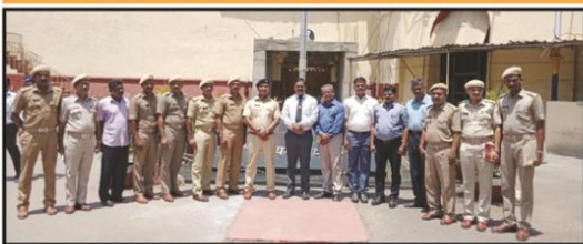
Trainee officers of 32 nd Batch of In-service Course during their visit to Central Prison, Thane.

A study tour to prisons and other allied institutions was organized for the trainee officers of 32 nd Batch of in-service