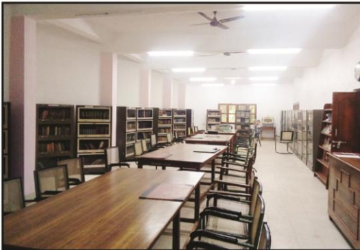
Renovated library building: Interior view.