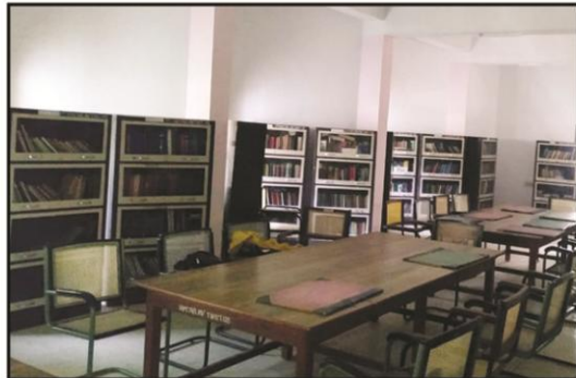
Renovated library building: Interior view.